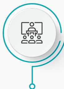
Conferences & Publications