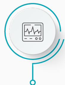
Equipment & Software